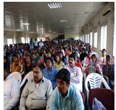
Students participated in seminar