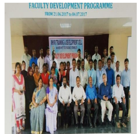
Faculty Development Program