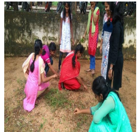
Swachha pakwada program