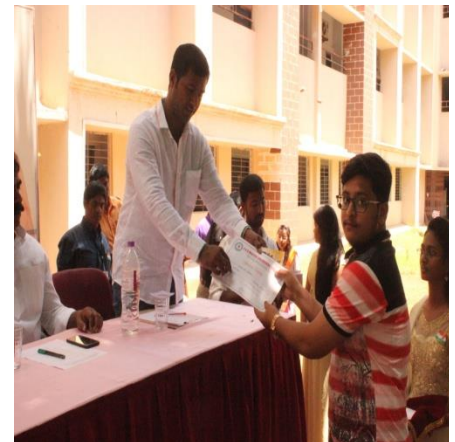
The Joint secretary handing over Certificates of Merit