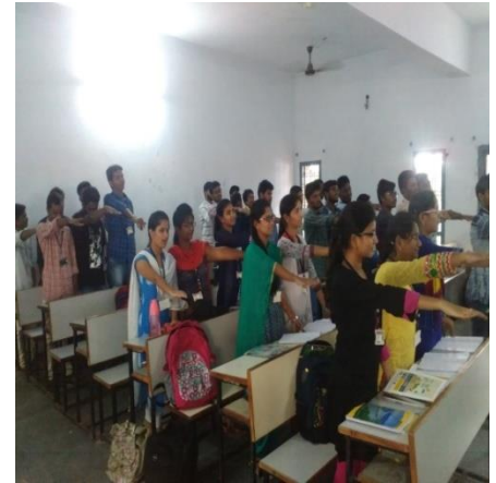
Swachh Pakwada –oath by students