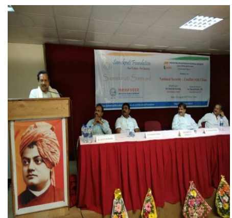
Seminar on national security Seminar on "National Security : Conflict with China"

A seminar on "NATIONAL SECURITY: Conflict with China" was organized in the institution on 26 Aug 2017. The Chief Guest was Sri Indresh Kumar and Guest of Honour was Sri Dinesh Reddy (Ex. DGP), Chief Patron: Forum for Awareness on National Security). The dignitaries gave their valuable messages to the students on this occasion.