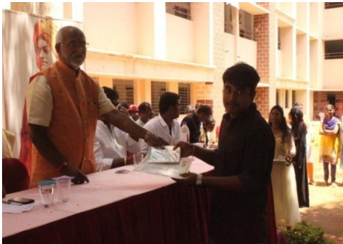
Prize distribution by chairman