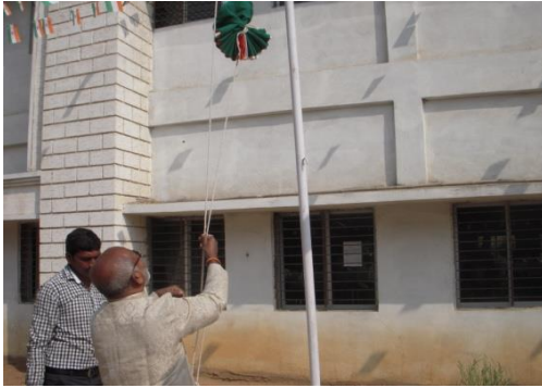
The Chairman hoisting the Flag